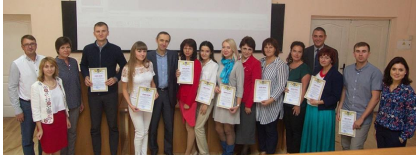
Fig. 4. Winners and active participants of the competition in 2016-2017

So, works with AR technologies were the best ones and won the competition. It happens because AR technology is a really up-to-date trend in educational projects.