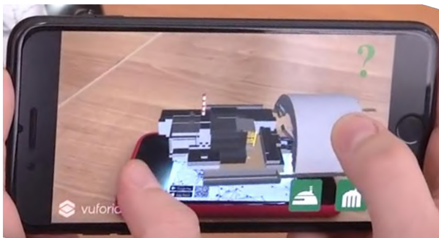
Fig. 1. Use example of application Chornobyl NPP ARCH AR

Application AR APP Chornobyl NPP ARCH AR [9] was officially launched in 2018. It can also be used for educational purposes (Fig. 1). According to the State Agency of Ukraine on Exclusion Zone Management this application helps to take closer look at the construction of the Arch and the Shelter object on a smartphone. You can look at the various details and get a real picture of the little things about the Shelter without risking human health. Its example is shown in fig. 1. It should be emphasized that in the such applications can be used to increase efficiency of emergency preparedness, response system and emergency situations on potentially hazardous sites. Such applications can be used to educate students in preparation of future specialists in the field of ecology and environmental protection. Also, new methods, algorithms and software need to be developed to address environmental security issues in areas of impact of potentially hazardous sites [5; 53; 54; 52; 63].