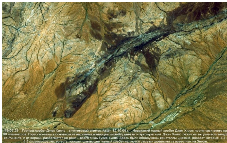
Fig. 6. Satellite image and its characteristics in the educational database of the ERS

mouse or the keys if it is not placed completely on the screen; Go to the next, previous, first and last image in the current watch list switching from window to full screen and back; change the properties of the current image; switching the slide show on / off; displaying a description of the image; calling application settings, etc.