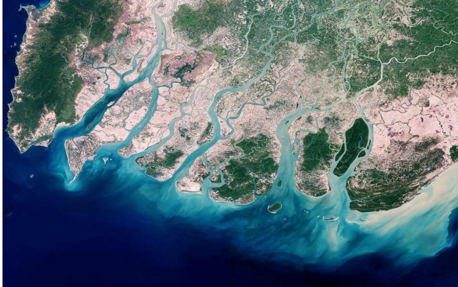
Fig. 1. The Irawadi River Delta (Myanmar). Satellite image, ISS