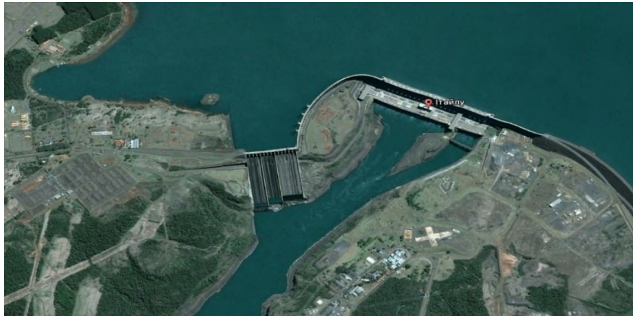
Fig. 3. Satellite image of the Itaipu hydroelectric station on the border of Brazil and Paraguay. Obtained using Google Earth Geosource