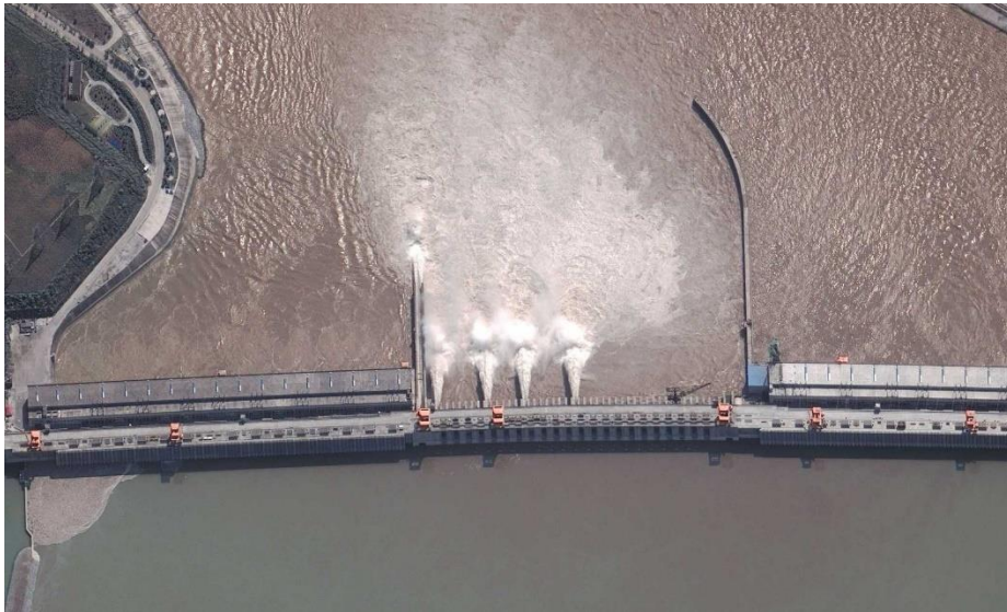
Fig. 2. Three Gorges Dam, China QuickBird Image: Collected September 23, 2007

The third group is represented by various interactive Internet geoservices: Google Maps, Google Earth, NASA World Wind, EarthNavigator, EarthBrowser and others. These resources allow one to get up to ten years old medium- and high-resolution images to be scaled, with the ability to scale (Fig. 3). They all offer user-friendly object