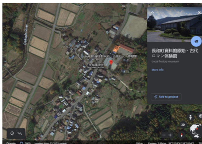
Figure 2: Example of supporting the Japanese language learning for future Japanese language teachers by using of the Google Earth AR.